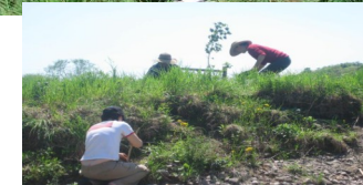
Tree planting at Little Seed Farm along the confluence of the Kinderhook & Stony Hill Creeks in Chatham, New York